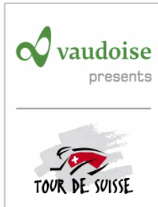
TABLEAU D'HONNEUR 9ème ETAPE MARTIGNY - SAAS-FEE 156,500 km